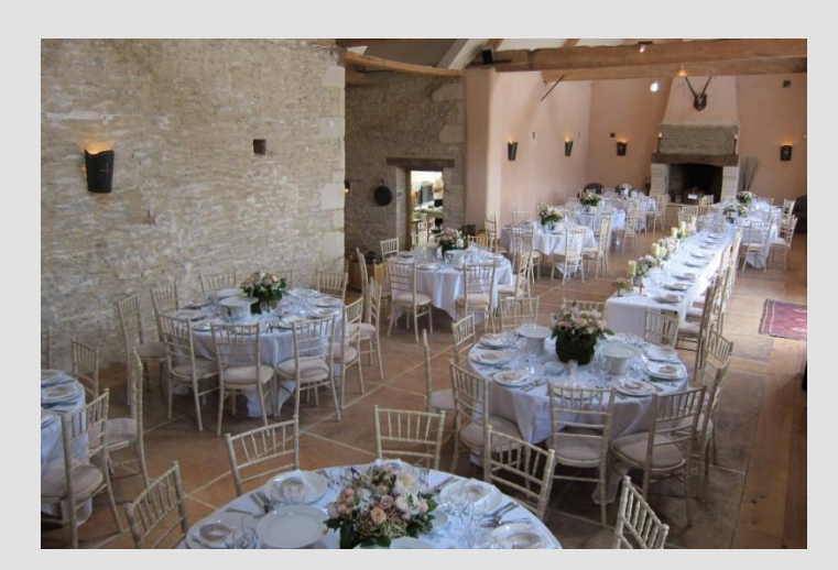
Wedding for 100 guests