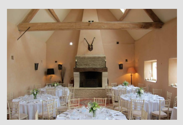
Wedding for 50 guests