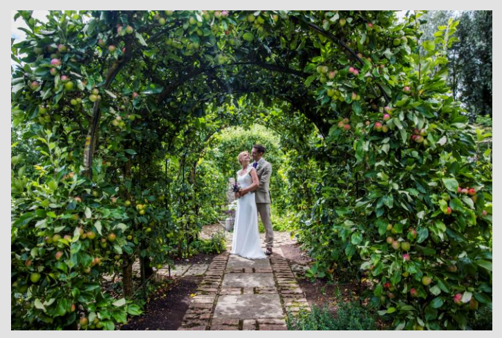
Private garden and grounds